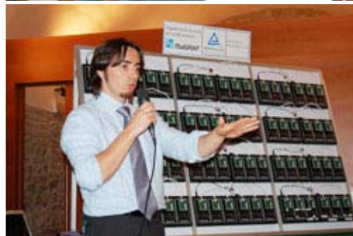
ICS Triplex ISaGRAF 70-controller IEC 61499 demo

The ISaGRAF IEC 61499 Demo Kit, an IEC 61499 and IEC 61131 tool that allows you to become familiar with distributed application environments, was also on display. Click here if you would like us to send you more information on the Demo Kit.